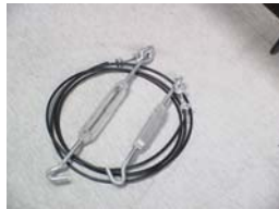
1- Cable (3 parts)