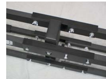
7. Tighten all nuts and bolts. Above, is a view of how it should look.