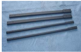
4 - Extender Legs ( 2 Upper, 2 Lower )