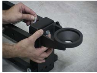
2. Re-attach the camera platform to the extension.