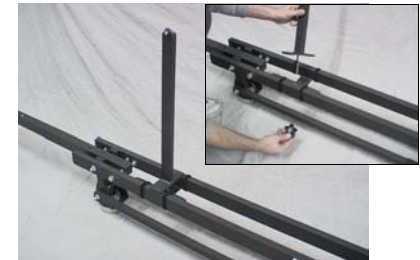
12. Attach the cable pole to the EZ FX Jib.