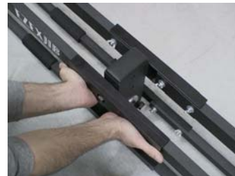
6. Now attach the other channels to the opposite side of the Jib.