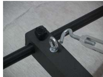
14. Hook the cable to the eyebolt at the end of the tail arm.