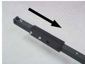
10. Loosen the wing nuts & slide the tail arm extension over the tail arm.