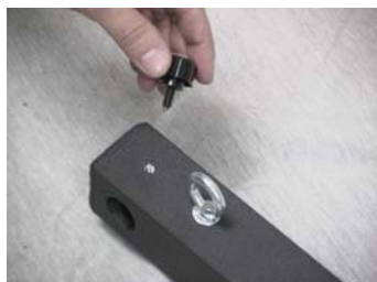
13. Re-attach the counter weight bar knob and longer 24" counter weight bar.