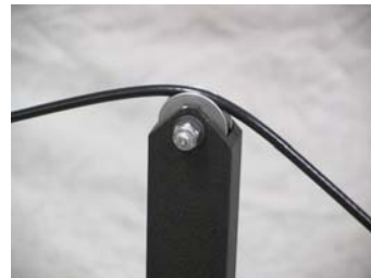
Run the cable over the roller at the top of the cable pole.