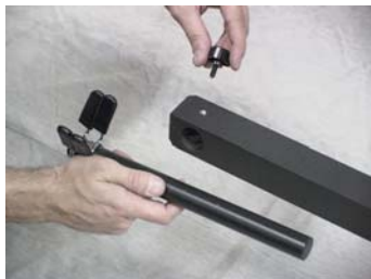
9. Remove the counter weight bar and knob from the end of the tail arm.