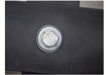
NOTE: Make sure that the channel's big hole, fits over the nylon washers.