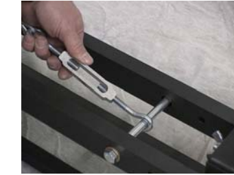
Hook the cable to cross barn near the end of the extension. Tighten the turn buckles to strengthen & straighten the Jib.