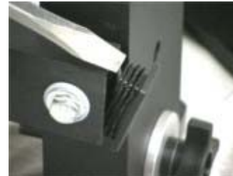
NOTE: You may need to remove the end cap if the connection is too tight.