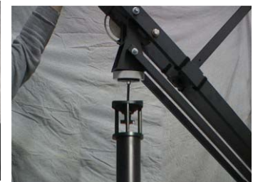
15. Refer to the EZ FX Handbook and mount the extended Jib just as you do in the standard set-up.