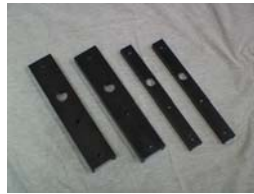
4-Coupling Channels (2 Upper, 2 Lower)