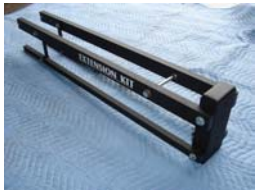
1- Extension Assembly