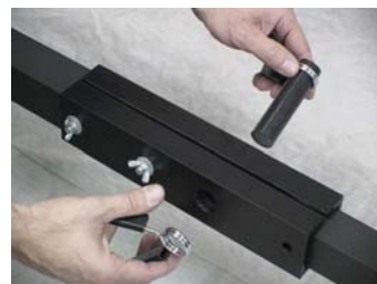
11. Align the large holes and slide the alignment pin through and attach w / clips.