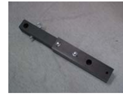
1-Tail Arm Extension