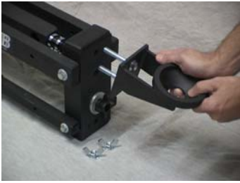
1. Remove the camera platform from the EZ FX Jib.