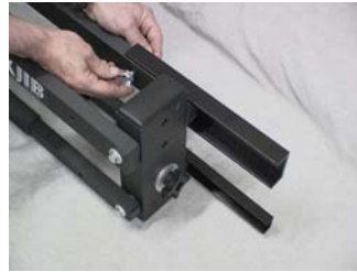
3. Connect an upper and a lower coupling channel to one side of the EZ FX Jib.