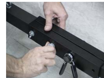
NOTE: Re-tighten the wing nuts after everything is aligned.