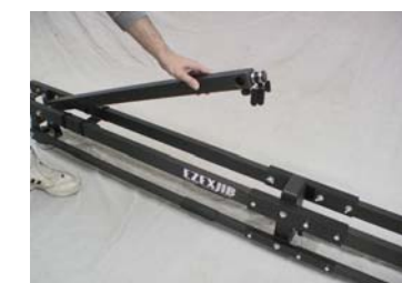
8. Fold over the tail arm of the jib to its extended position.