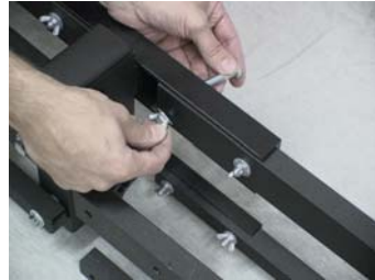
5. Use the bolts and wing nuts to secure the extension to the channels.