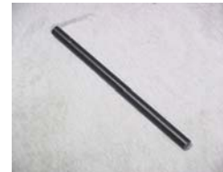
1- 18" Counter Weight Bar

12 - 3/8 x 1 3/4 Bolts 12 - 5/16 x 1 3/4 Bolts 12 - 3/8 Wing Nuts 12 - 5/16 Wing Nuts