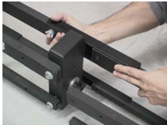
4. Attach the extension piece to the coupling channels. Do upper and lower channels on one side first.